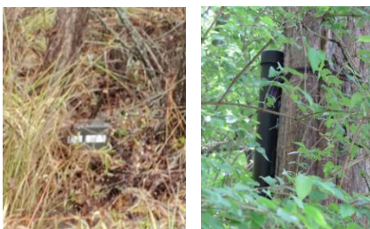
Transmitters can be on the ground, up in a tree or elsewhere.