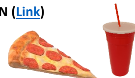
Pizza & drinks will be provided, compliments of the Cleveland Amateur Radio Club.