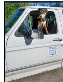
Partner up! Have a designated driver.

Important: Safety first! Be courteous, follow the law & drive responsibly. No distractions, speeding or reckless behavior. Do not operate transmitter finding equipment while driving. Either partner with another participant separating driving & transmitter roles or park in a safe location prior to using transmitter finding equipment.