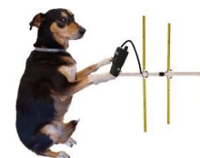
I had to borrow gear because my sniffer wasn't tuned for these foxes!