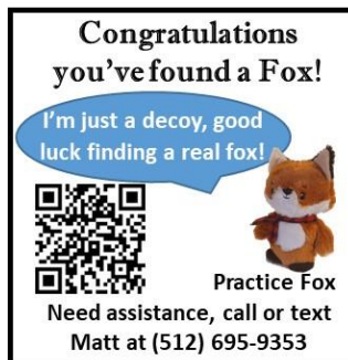
Scan this QR code to practice "Punching In"