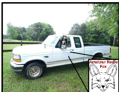
Mobile "Fox" truck & placard

The mobile fox truck, identified by fox placards on its sides & back window, will transmit and be periodically moved within the hunt zone, then be parked at each location for ~ 15 minutes. If the "fox" truck is found while it is in transit, the pursuing driver is to signal with their horn twice in rapid succession so the "fox" truck can then be driven to the next safe parking location to confirm and then announce, via repeater, the find. After a find, if time permits, the "fox" truck will be deployed again to enable another hunt opportunity.