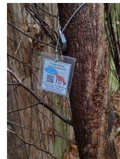
Punch-In placard example. Transmitter is in close proximity.