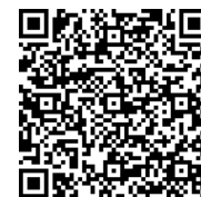
Interactive Map QR Code

Six fox transmitters will become active in the morning within the 9 mi x 9 mi white outlined hunt zone as shown on this map ( interactive map ). One is mobile, being stationary in different locations for ~15 minute periods. The fixed transmitters will be within a relatively short walking distance ( \leq 200 yds.) from areas where vehicles can be parked.